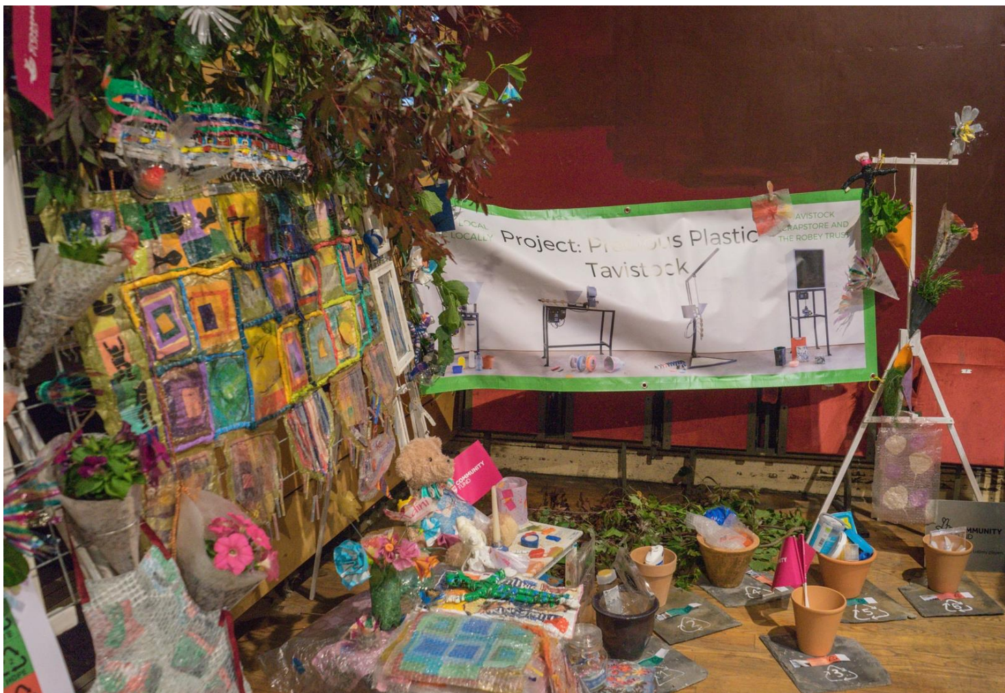
Plastic experiments with West Devon Arts Workshops at the Robey Trust Steam Fair

Sadly, the space in Tavistock was no longer viable for the project after lockdown but when one door closes another opened and the machines will be coming together to support our joint project.